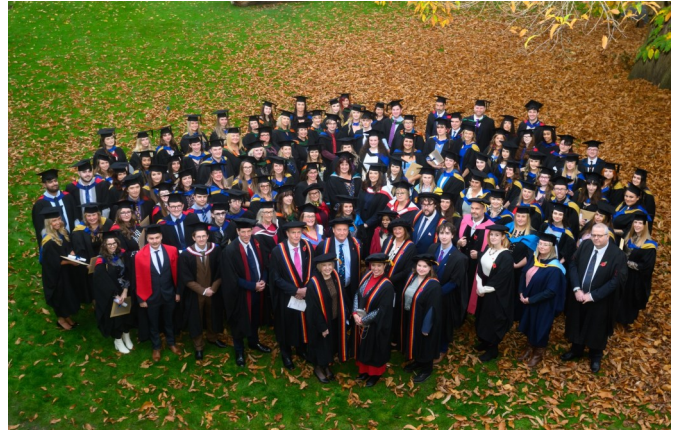
Graduates celebrate in Warwick

Moreton Morrell College is hosting an open event on Saturday, 11 January 2025 from 10am until 1pm.